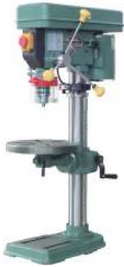
Bench top model