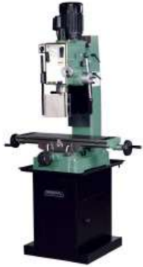
Shown with optional stand (#75-885)