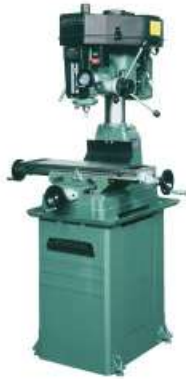
Shown with optional stand (#75-855)