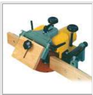
Deluxe adjustment fence system