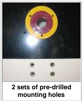
2 sets of pre-drilled mounting holes