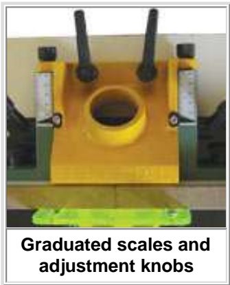
Graduated scales and adjustment knobs