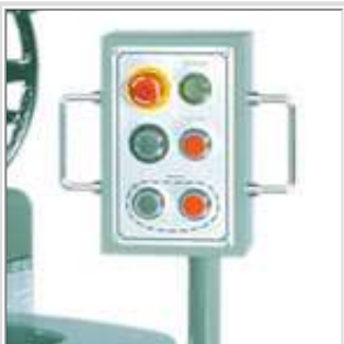
Panneau de contrôle accessible