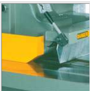
Precision-built v-way track ensures absolute straight line rip cuts