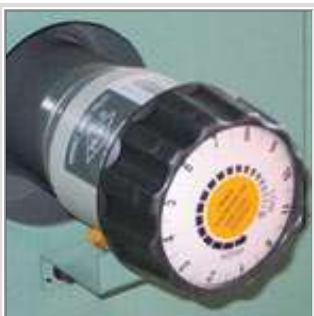
Convenient easy access control panel