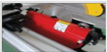
Maintenance-free round guide rail system