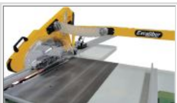
Excalibur blade cover / Dust hood