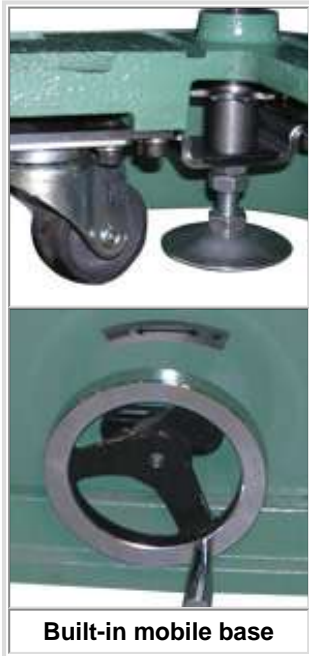
Built-in mobile base