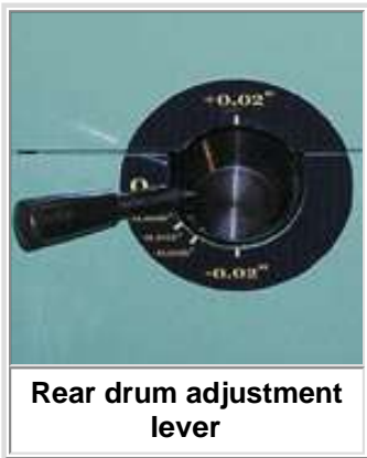
Rear drum adjustment lever