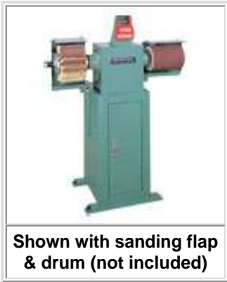
Shown with sanding flap & drum (not included)