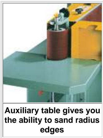
Auxiliary table gives you the ability to sand radius edges