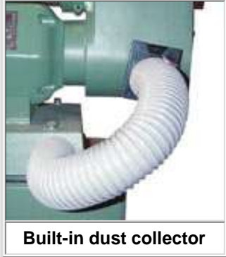
Built-in dust collector