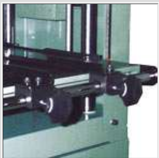
Adjustable guide fence system included