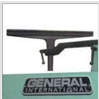
14" tool rest