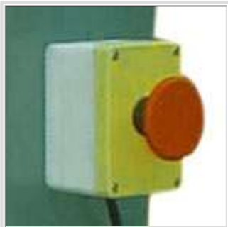
Movable emergency switch