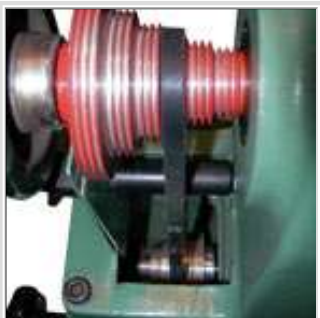
V-belt provides smooth turning

Quick lock control levers easily position tool rest.