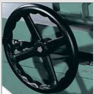
Table adjustment wheel

ITEM #885H : 16" HELICAL CUTTER HEAD 4 rows, total: 46 inserts