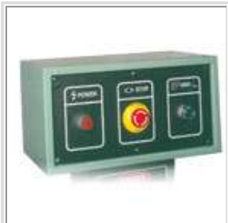
Easy to reach control box