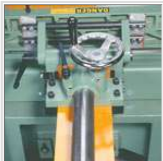
Easy access fence adjustments

ITEM #400H : 16" HELICAL CUTTER HEAD 4 rows, total: 46 inserts