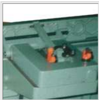
Easy fence adjustments