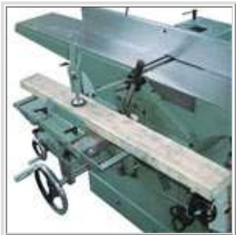
Removable mortising attachment