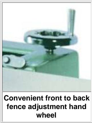
Convenient front to back fence adjustment hand wheel