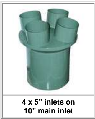
4 x 5" inlets on 10" main inlet