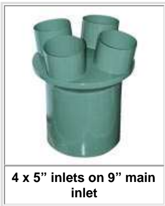
4 x 5" inlets on 9" main inlet