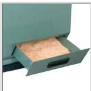
Easy access metal collection tray.