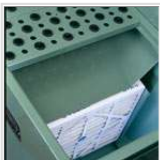
Pleated inner filter. #10-705