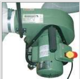
Comfort grip carrying handle