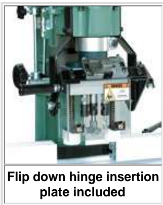
Flip down hinge insertion plate included