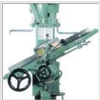
Table tilts 45° (right-left)

Precision-machined cast-iron table on guide ways with adjustable gibs.