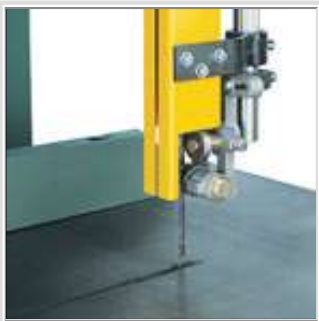
Telescopic rod & hand wheel system