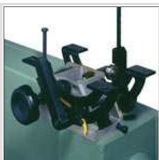
Heavy-duty table support