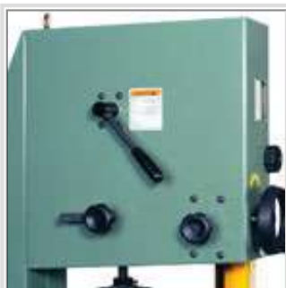
Quick release blade tension